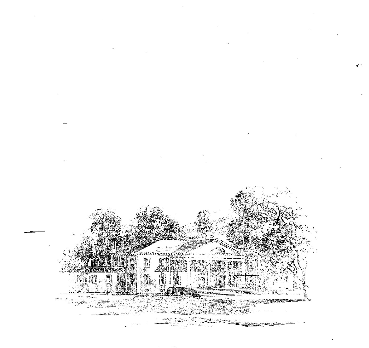
JAMES NADLOR With official contrast engraved from they of any data in steel